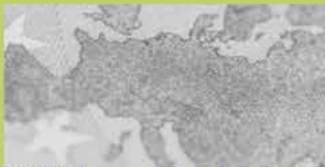
GDPR & European Privacy Law: Rights, Obligations & Data Transfer