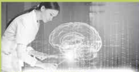
HIPAA & US Regulation of Health Data