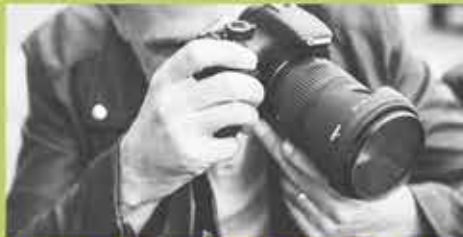
Privacy Torts & The Media in the US