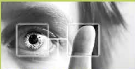
Foundations & Themes of US Privacy Law

Created by two international experts, these online courses provide a clear and engaging introduction to privacy law. Each course is about 1 hour long and contains readings and a quiz.