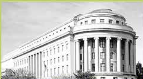
Consumer Data & US Regulation: The Common Law and the FTC