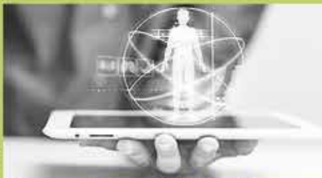
Consumer Data and US Regulation: Statutory Law