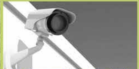
Law Enforcement National Security in the US