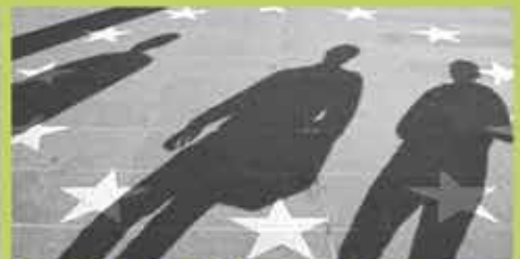
GDPR: Rights, Obligations & Data Transfer